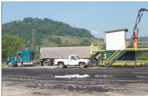
Coal weighing and sampling at Big Sandy coal wharf