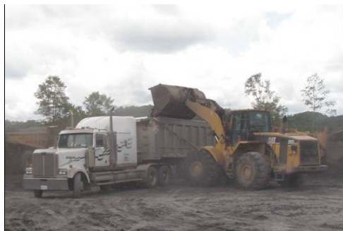
Loading Coal at Mill Creek